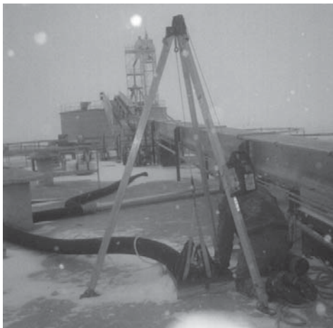
HK Personnel Performing Confined Space Entry

Next time you find a challenging grain project, consider Hydro-Klean's cleaning, vacuuming and salvaging services. HK's work ethic may make it the most efficient and safety-conscious choice around when dealing with grain-cleanup problems.